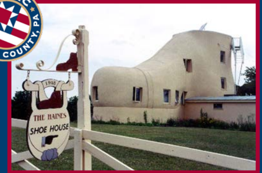
The Shoe House