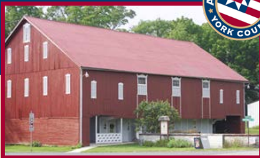
Maple Shade Barn

York County Planning Commission 28 East Market Street York., PA 17401 717-771-9870 www.ycpc.org