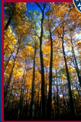
Rocky Ridge County Park