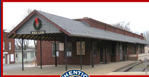
Red Lion Train Station Museum

Take some time to visit! You can experience York County's heritage through its history, nature, and culture.