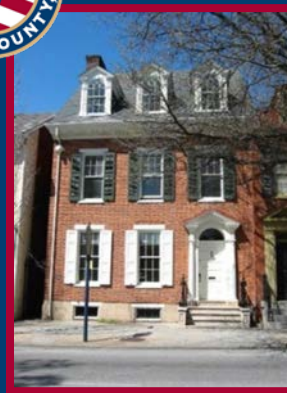
Goodridge Freedom Center