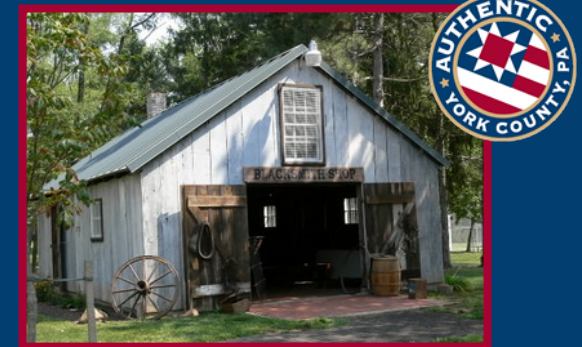
Dover Blacksmith Shop